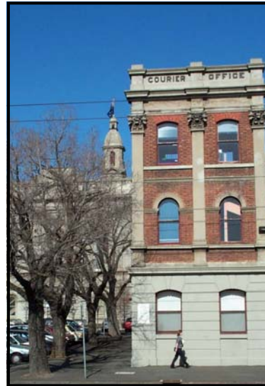
SPCHG Head Office 259 Dorcas St South Melbourne